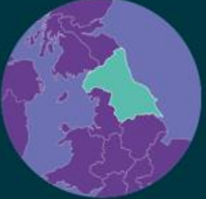
Northern & Yorkshire